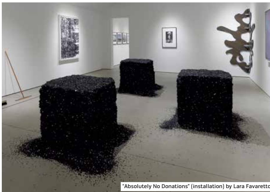
"Absolutely No Donations" (installation) by Lara Favaretto