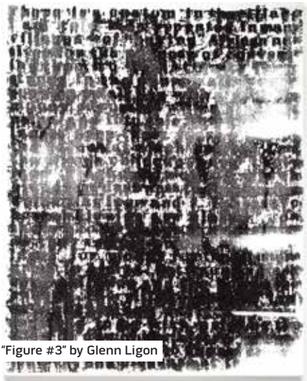
"Figure #3" by Glenn Ligon

"Ready. Fire! Aim.," through November 26 at Hall Art Foundation in Reading. hallartfoundation.org