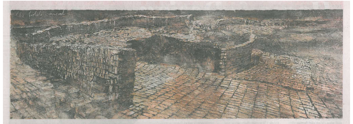
Im Kiefer's 'The Fertile Crescent' shows the remains of a brick factory in the desert, with thousands of those building blocks forming a circuitous wall and pavement.