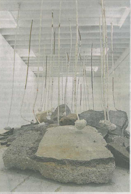
'Rising, rising, falling down' is made from asphalt, concrete stones and the remnants of a demolished street in Paris.

nant. The woodcuts are a nod to the place where Gutenberg invented the printing press — mechanization that allowed scenes from the Bible to be distributed on a mass scale. One woodcut is a collage of faces of famous German philosophers, writers and musicians — seemingly