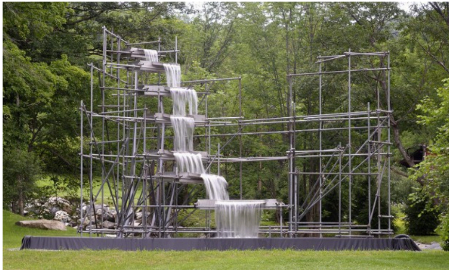
The work of Olafur Eliasson, on display at the Hall Art Foundation in Reading, Vt.

In New England, contemporary art lovers who need a dose of new art can go in several directions — heading east to Boston's Institute of Contemporary Art, or west to Mass MoCA in North Adams.