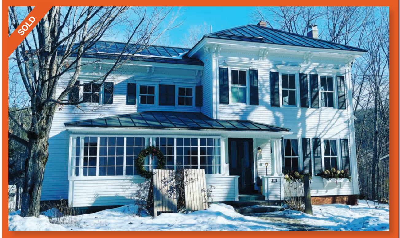
10 LINDEN HILL - Woodstock, VT $1,050,000