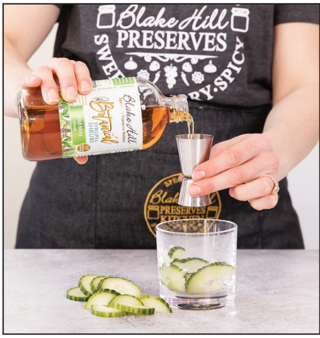
Pictured is Blake Hill Preserves' finalist wild mint shrub entry for the Good Foods Award.

The Lex café is opened during winter facility hours, offering sandwiches, hot chocolate, mulled wine, coffee and tea; and in the warm weather, baked goods, salads, snacks and more. The food is provided by Brownsville Butcher