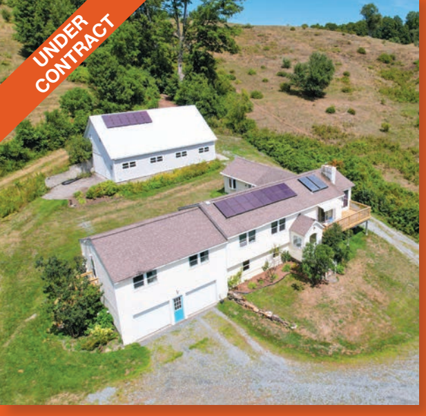
204 HEWITT HILL ROAD - Pomfret, VT $499,000

5 The Green, Woodstock, VT • 802-457-2600 | 35 South Main Street, Hanover, NH • 603-643-0599 team@snyderdonegan.com www.snyderdonegan.com