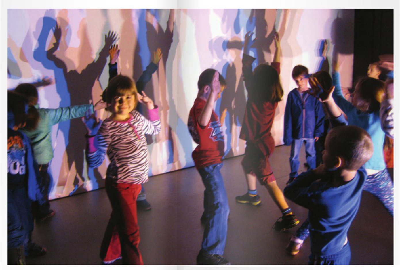
Students from Reading Elementary School in front of Olafur Eliasson's Your uncertain shadow (growing) (2010) at the Hall Art Foundation in Reading, Vermont, last year.

Eliasson's playground of water babbling alongside a tributary of the Black River.