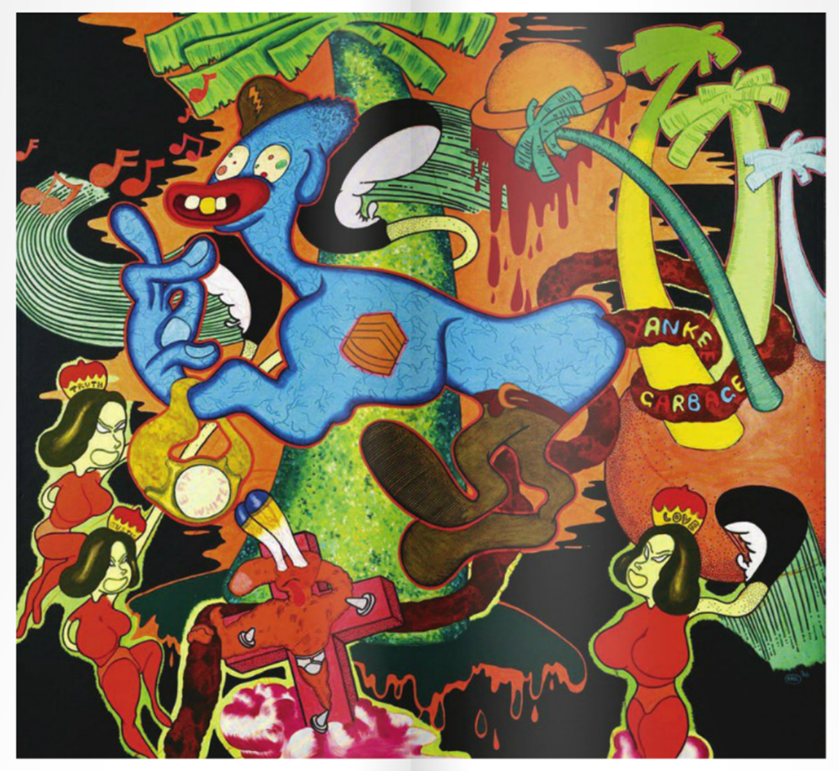
Peter Saul, Yankee Garbage, 1966. Acrylic and felt tip pen on canvas, 71¾ x 69¼ inches. Hall Collection. © Peter Saul.

Sedenii) (2003–2004), a 20-foot-tall rendering of an orchid in a way that reminds the artist "of an image stuck on the front of a child's plastic toy."