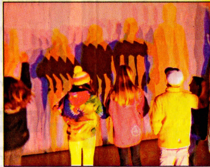
At left, kids stand in front of a white wall with special lighting that makes multi colors and growing shadows using halogen lamps, glass, aluminum and transformers. On the right kids stand on either side of a yellow double kaleidoscope made from stainless steel, mirrors and color-effect filter glass.