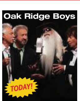
SUN | MAY 20 | 7PM

Customer service: Tel: 1-877-574-1486 | customerservice@gudrunsjoden.com